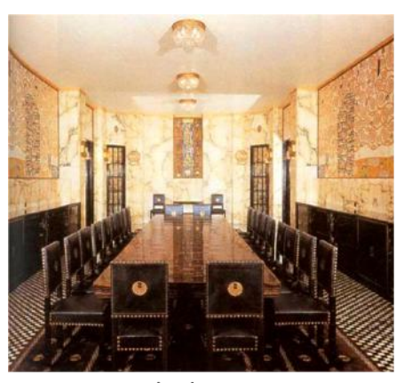
Sala da pranzo