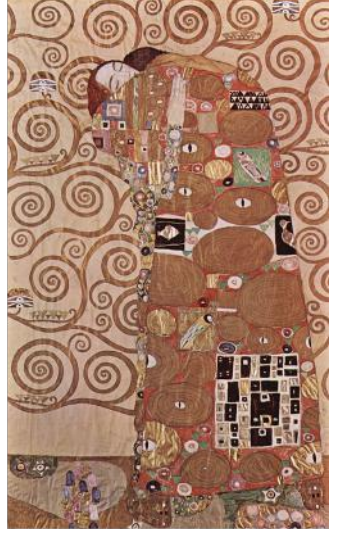
Gustav Klimt FRIEZE OF PALAZZO STOCLET WORLD HERITAGE - UNESCO

The frieze, which Klimt designed for the dining room of the palace of the wealthy Stoclet bourgeois family, is made, according to his precise instructions, by the skilled craftsmen of the Wiener Werkstätte. It is a mosaic of marble, coral, hard and majolica stones.